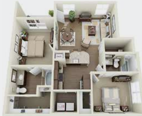
FOUNDER 2 BR | 2 BA | 1,037 SF