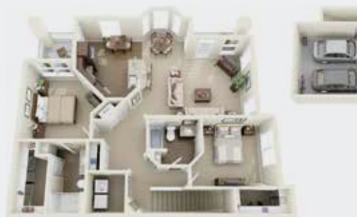
STONEWALL 2 BR | 2 BA | 1,348 SF