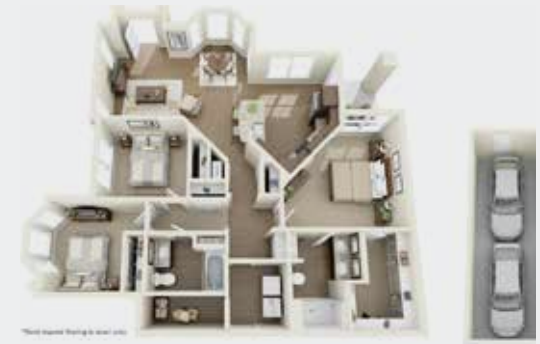
FARMHOUSE 3 BR | 2 BA | 1,404 SF