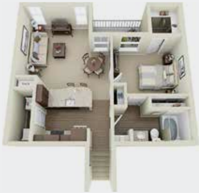
CHELSEA 1 BR | 1 BA | 871 SF