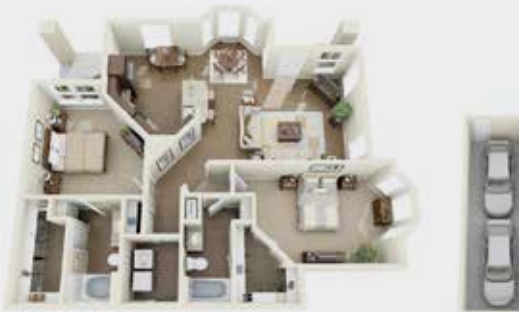
GRAYSON 2 BR | 2 BA | 1,308 SF