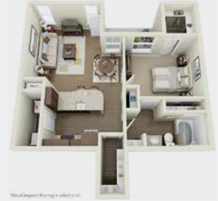
CAHABA 1 BR | 1 BA | 771 SF