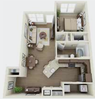
BROOKLEY 1 BR | 1 BA | 762 SF

Retreat at Greystone is a one-of-a-kind experience you simply won't want to miss!