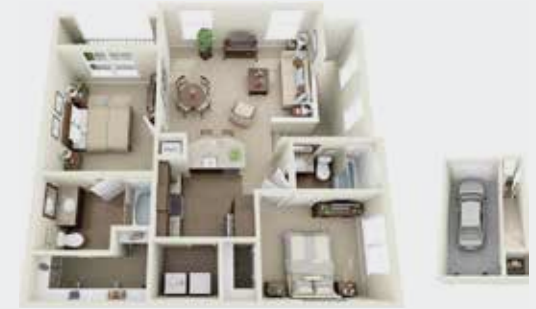
LEGACY 2 BR | 2 BA | 1,097 SF